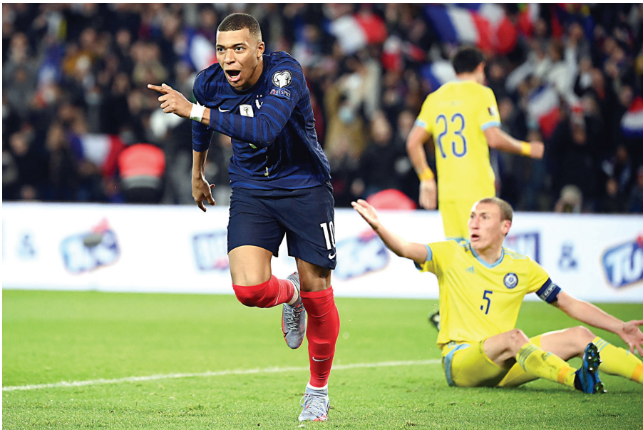
Kylian Mbappe scored four goals in France's 8-0 win against Kazakhstan.

away from its usual home venue Stade de France and took the field at Parc des Princes, where Mbappe stars for Paris Saint-Germain.