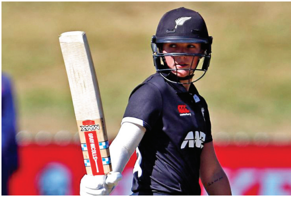
Amelia Kerr starred for New Zealand with an unbeaten 119.

completed the task for New Zealand with a swipe over the fielders at cover to ensure a hard-fought win for the hosts. This was Amelia's second ODI century and came with the help of seven boundaries.