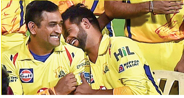
File photo of M.S. Dhoni with Suresh Raina.

"Suresh Raina #chinnathala who played for Chennai and has been a prolific scorer goes unsold at IPL.